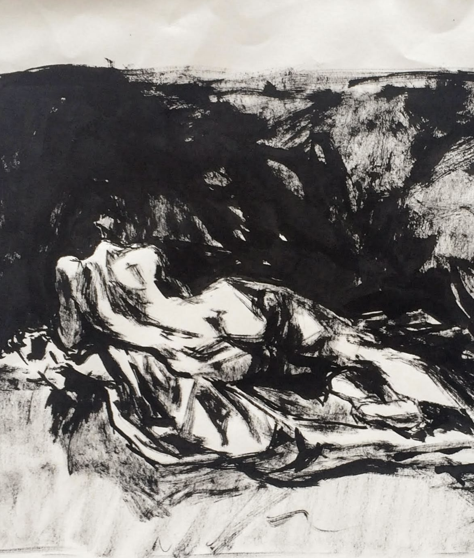
Woman (Enoch ca 1840) Nade Woman oil canvas