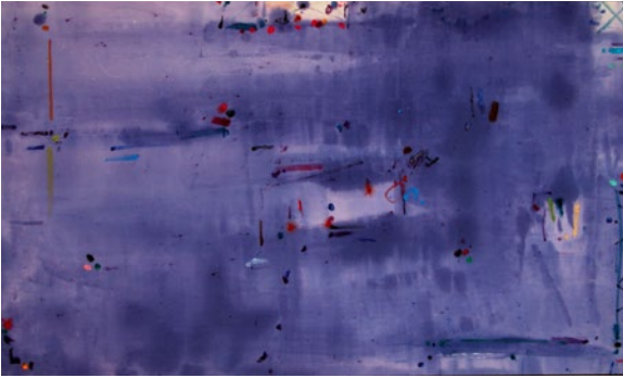
Spider's Window , 1988 acrylic on canvas 49 x 81 1/4 inches Kitchener-Waterloo Art Gallery, Ontario

Works related to Silver Camel have also been widely collected, appearing in private, corporate, and public collections. Examples include: