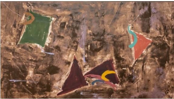
Regatta Night, 1981

These works are also widely collected, including an early Color Field work at the Museum of Modern Art.