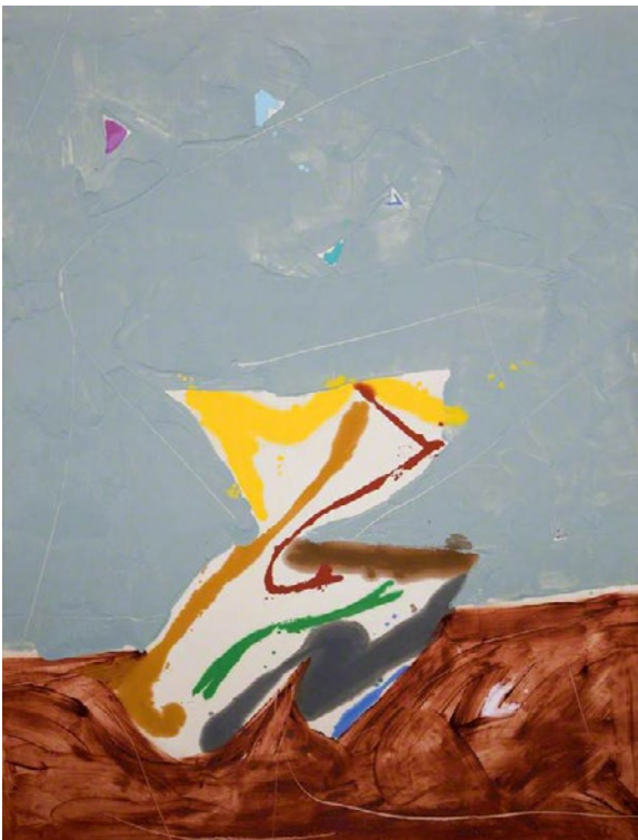
Windy Paws , 1979 oil on canvas 106 2/3 x 64 inches Ulster Museum, Belfast National Museums of Northern Ireland