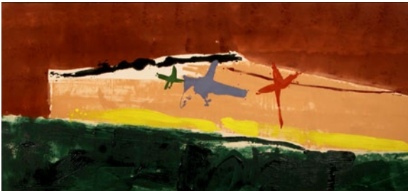
Slippery Point , 1981 oil on canvas 51 1/2 x 111 1/3 inches Kitchener-Waterloo Art Gallery, Ontario