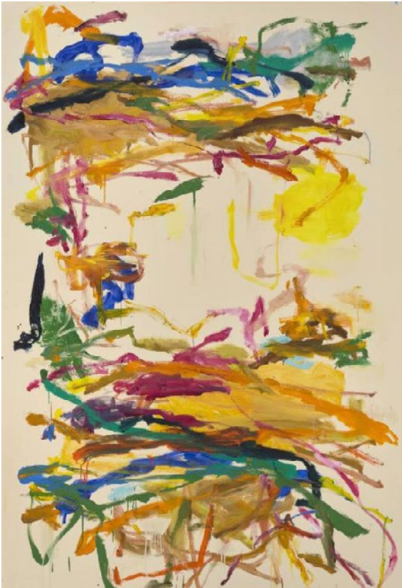
Quenka , 2012 oil on canvas 65 1/4 × 44 3/4 inches The Museum of Fine Arts, Houston, TX

Painted in 2010, Copper Moon exemplifies Saito's late style of loose, colorful brushstrokes. Works from this period have been widely collected in both private and corporate collections, along with select public collections.