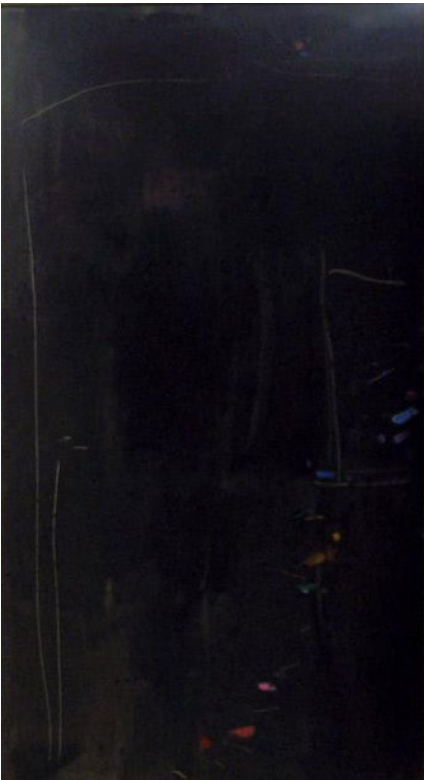
Monkey's Alphabet , 1985 acrylic on canvas 81 1/4 x 50 3/4 inches Nasher Museum of Art, Durham, NC Duke University