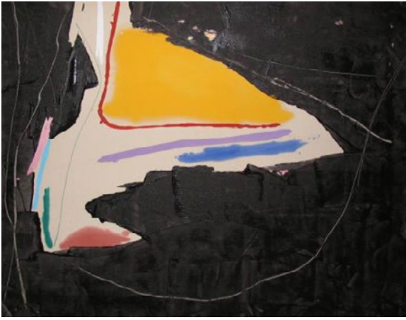
Wistar's Night , 1978 acrylic on unprimed canvas 62 1/4 x 72 1/4 inches Nasher Museum of Art, Durham, NC Duke University