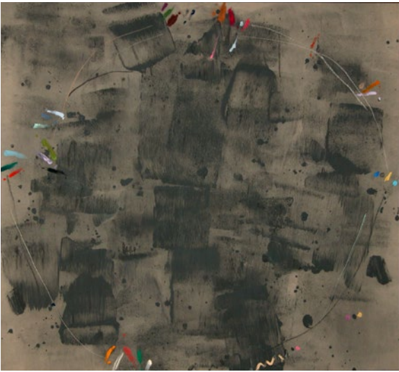
Spanish Arrow , 1987 acrylic on canvas 61 1/2 x 66 1/2 inches Kitchener-Waterloo Art Gallery, Ontario