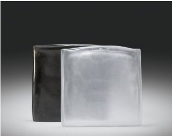
Cristallo e Bronzo (Crystal and Bronze) More Info , 2007 glass and bronze 17 3/4 x 25 1/2 x 5 1/2 inches