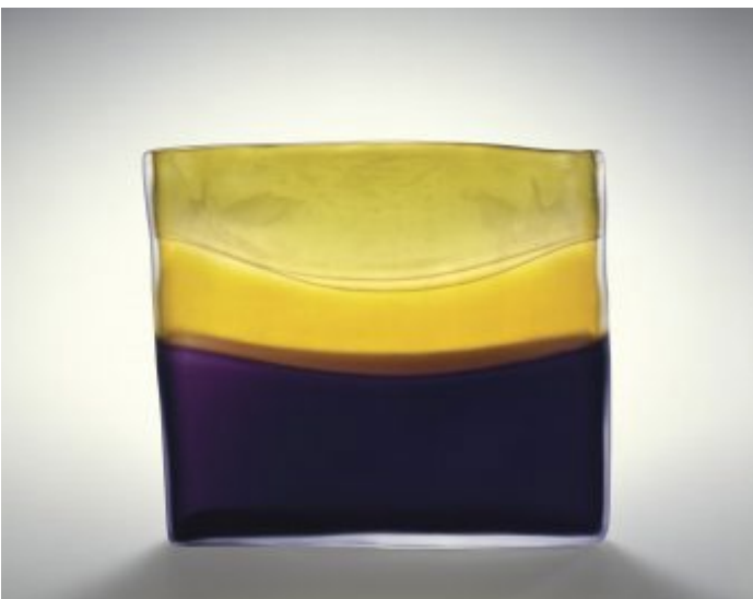
Sun Chariot , 2002 glass 16 1/4 x 18 3/4 x 2 1/4 inches