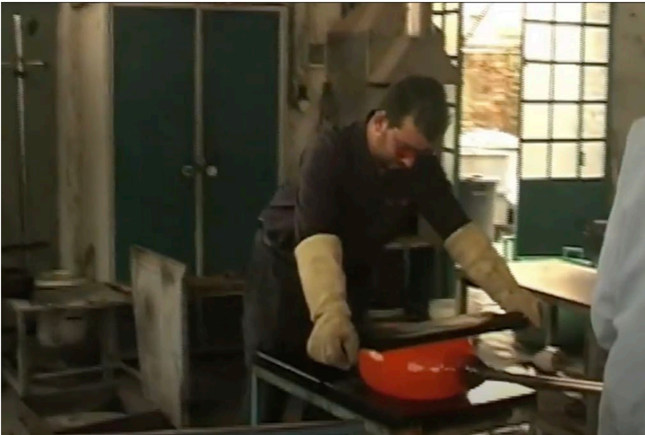
One of de Santillana's signature flat glass forms in the process of being compressed