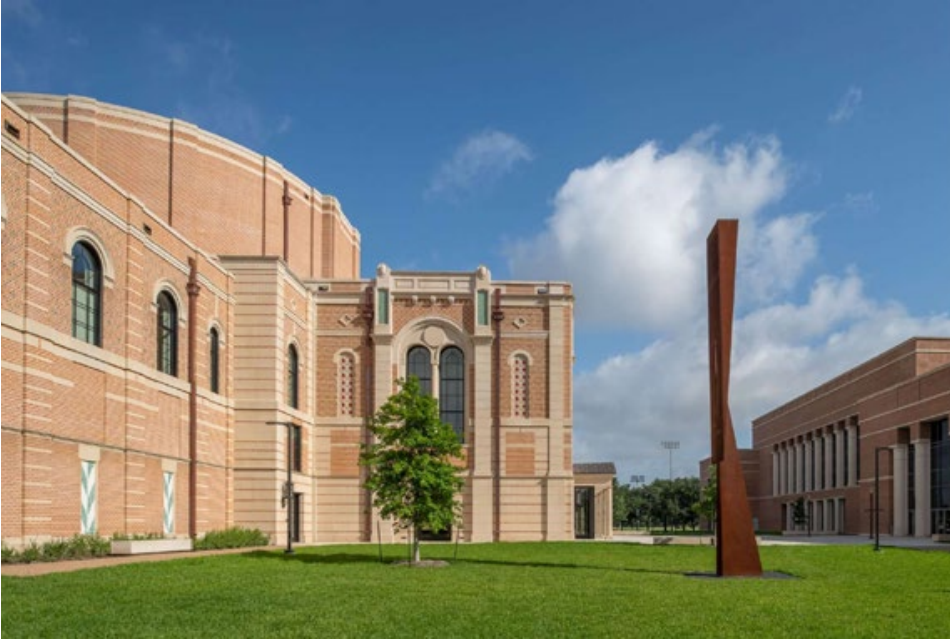
Occam's Wedge , 2008-2021 Rice University, Houston, Texas

James Barron Art has placed monumental Pepper works with numerous public and private collections. Placements include: