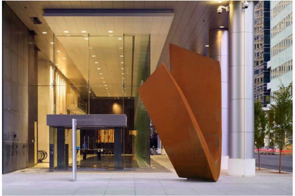
Nuova Twist , 2008 Banker's Court in Calgary, Canada