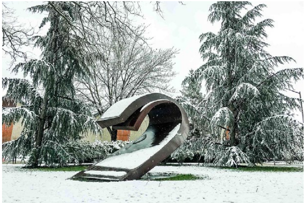
Double Sbalzo , 2012 Pratt Institute, Brooklyn, NY

The Cassino Museum of Contemporary Art in Cassino, Italy opened in 2013 to house Sergio and Maria Longo's extensive collection. Sergio Longo's company Iron produces Cor-Ten / Indaten steel, one of Pepper's signature mediums. The sculpture garden at the Cassino Museum of Contemporary Art features multiple monumental Pepper Cor-Ten works, including: Octavia , 2014; Curved Presence , 2012; Helena , 2014; Nuova Twist , 2010; and Longo Monolith , 2007.