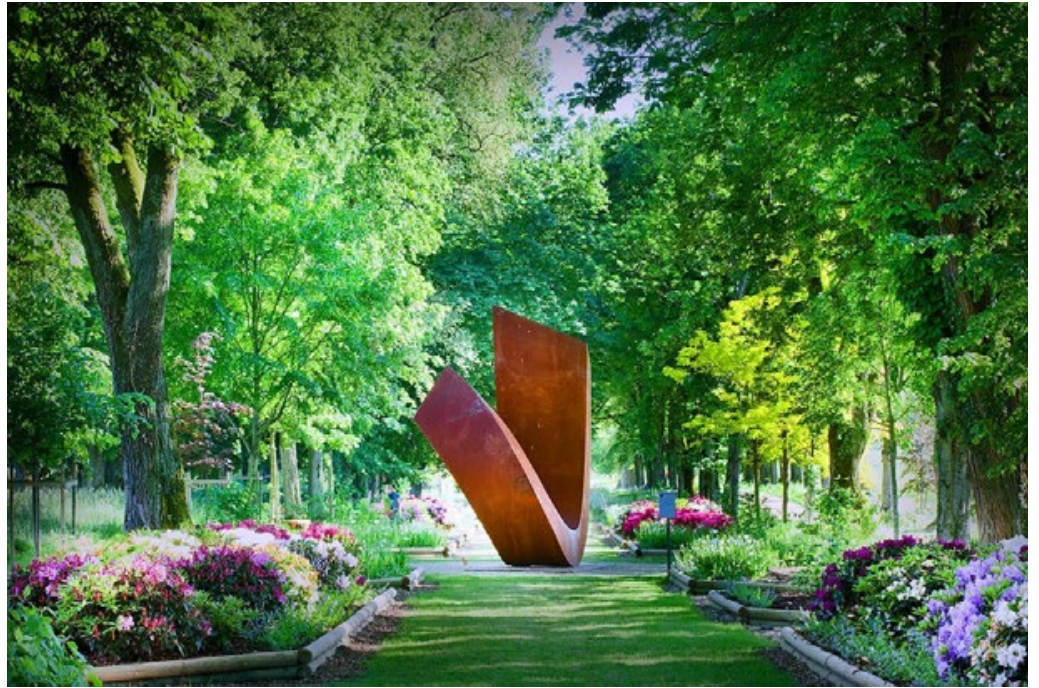
My Twist , 2008 Muni au Château de Vullierens, Switzerland