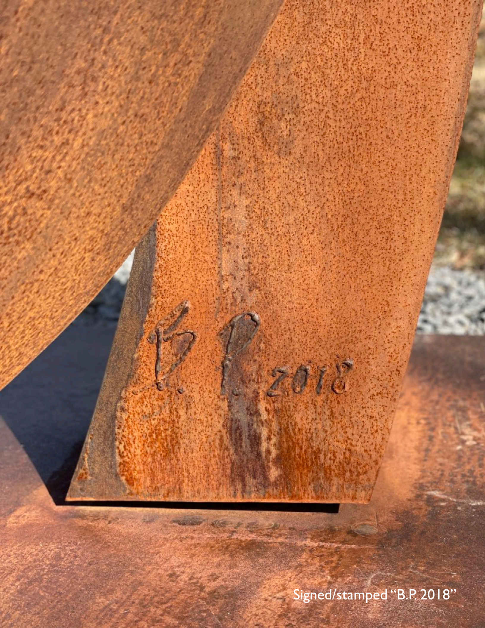
Signed/stamped "B.P. 2018"