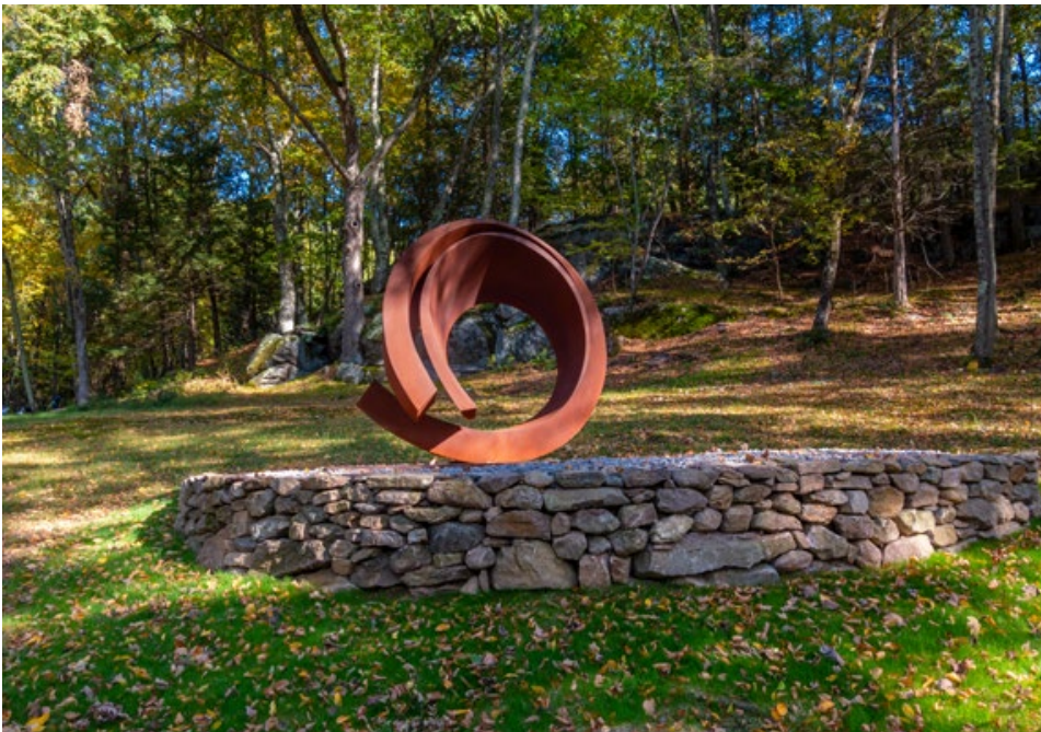
Clodia Medea , 2014-2018

Placed in an important private collection, United States