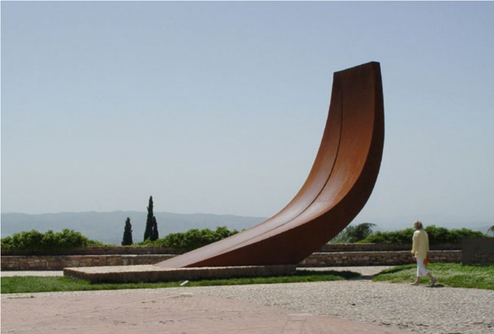
Ascensione , 2008 Piazza San Pietro, Assisi, Italy

Pepper's late Cor-Ten works have been widely collected. Selected public and private collections include: