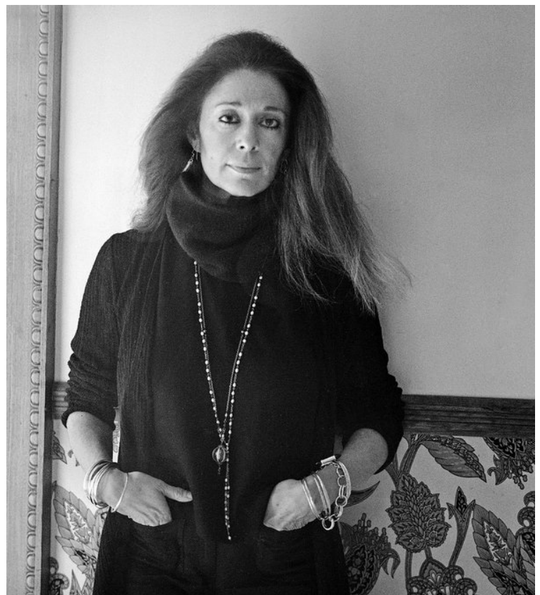
Jorie Graham

Jorie Graham Executor of the Beverly Pepper Estate