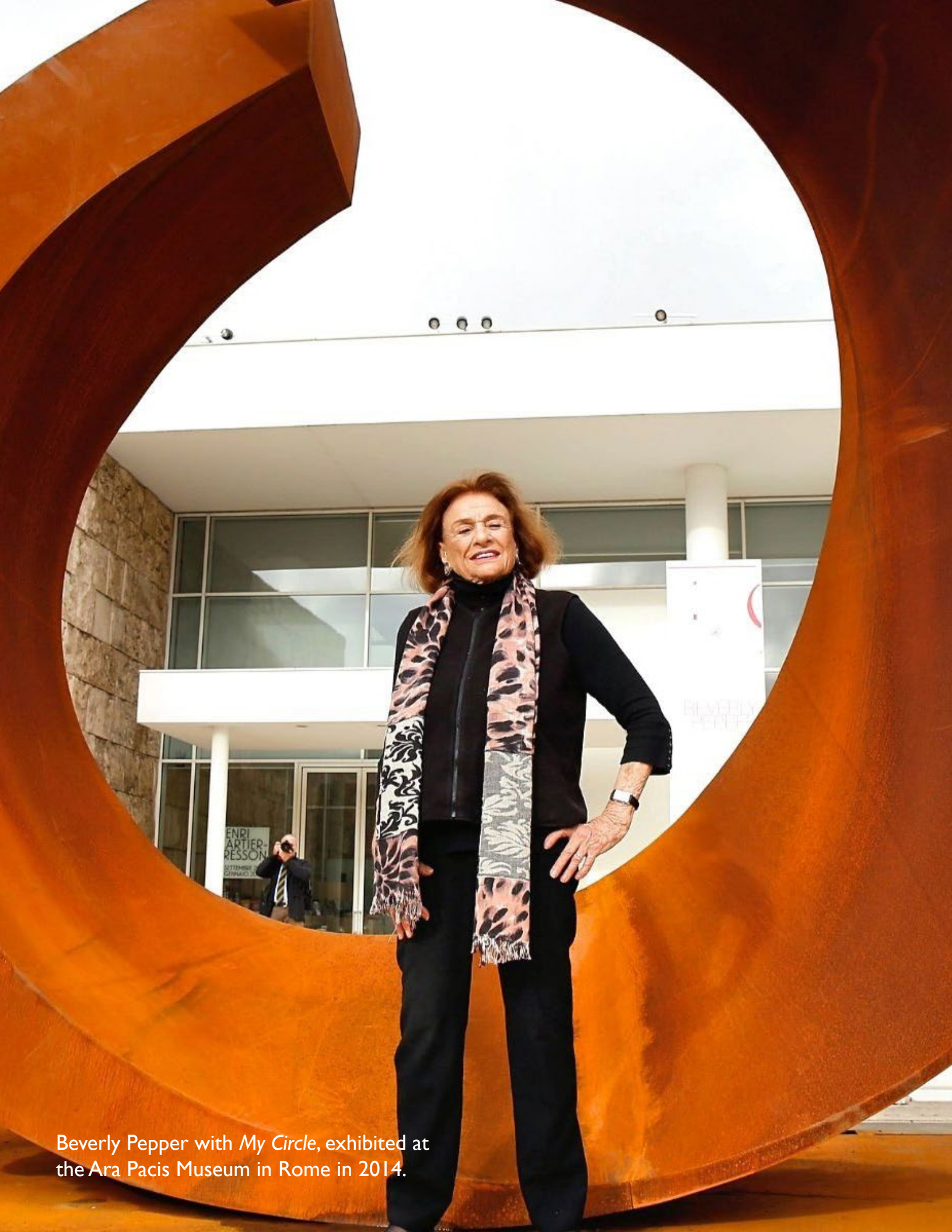
Beverly Pepper with My Circle , exhibited at the Ara Pacis Museum in Rome in 2014.