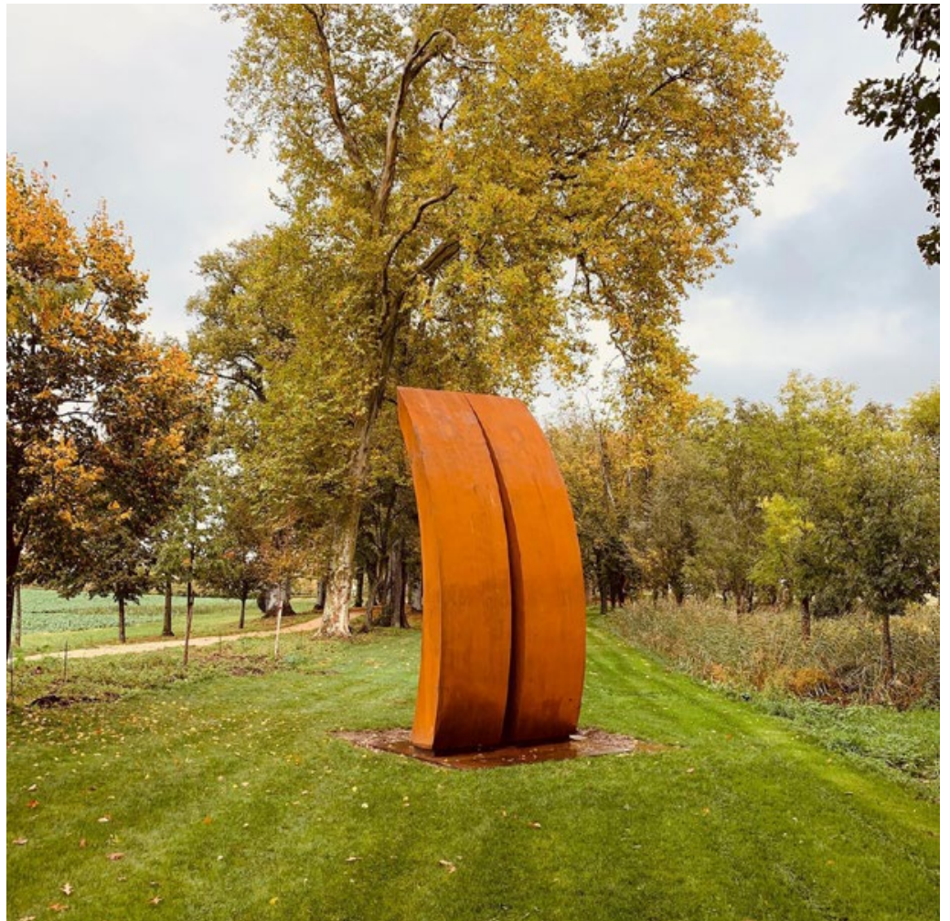
Longo Monolith , 2008 Muni au Château de Vullierens, Switzerland