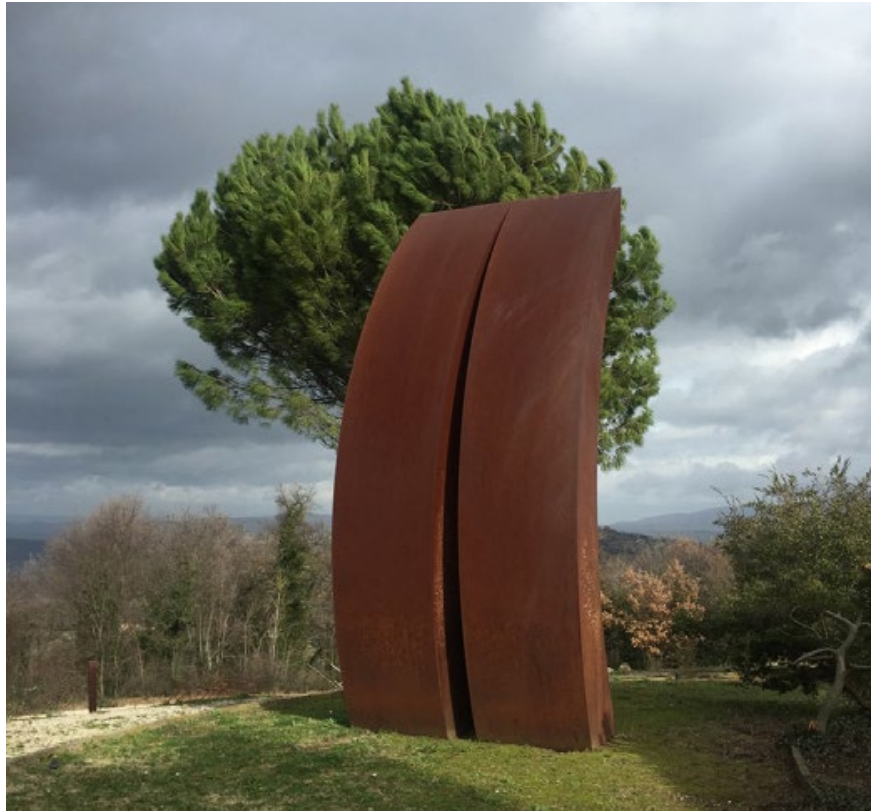
Longo Monolith, 2008

Placed at the US Consulate in Milan for their new building designed by SHoP Architects, to be installed upon completion of construction.