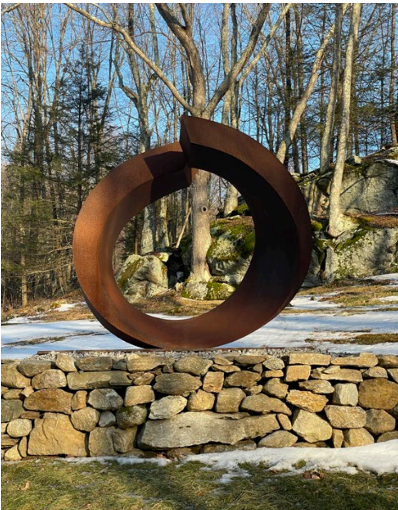
My Circle , 2008-2018

Placed in an important private collection, United States