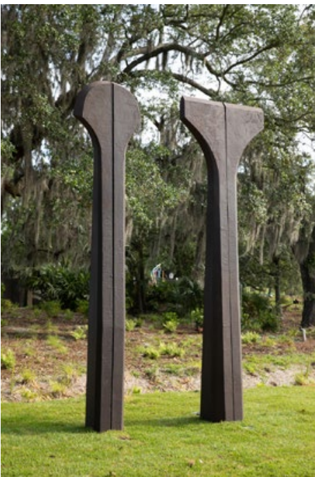
Split Ritual II , 1996 Sydney and Walda Besthoff Sculpture Garden New Orleans Museum of Art, New Orleans, LA