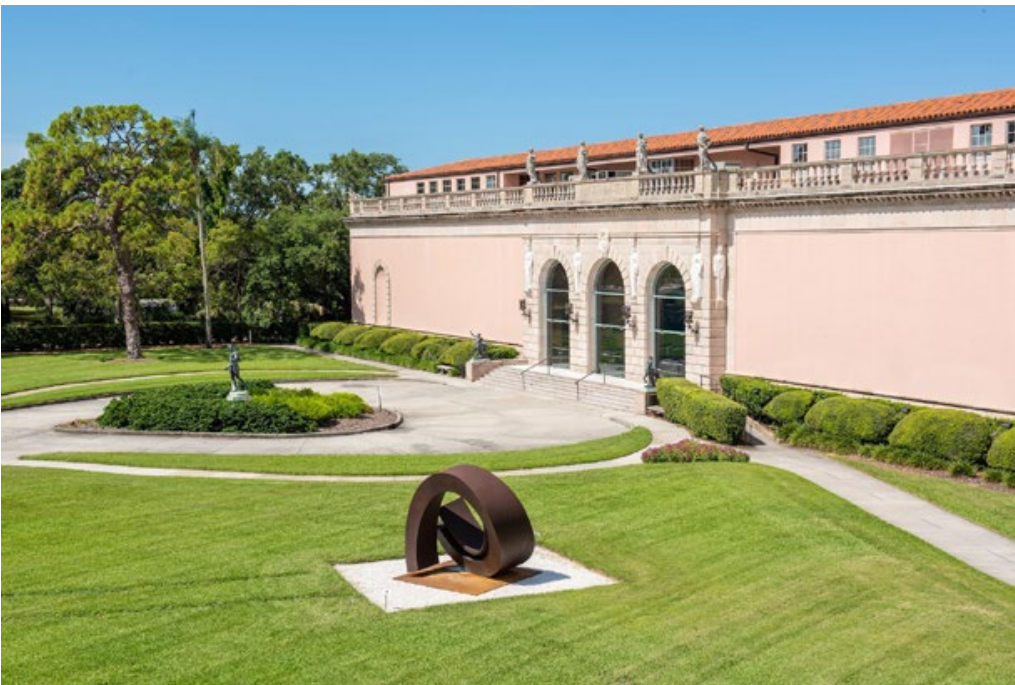
Curvae in Curvae , 2012 Ringling Museum of Art, Sarasota, Florida